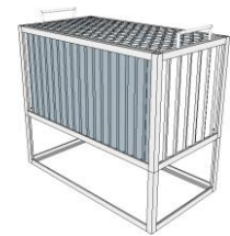
COLEASER PACK (OPTIONAL)